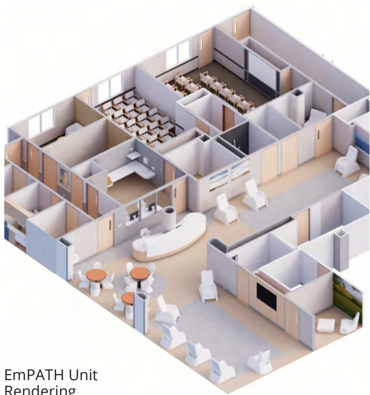
EmPATH Unit Rendering