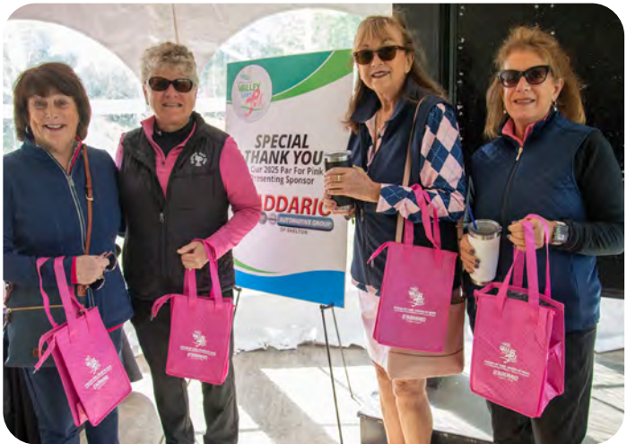
Par for Pink Golf Outing on May 20 at Oxford Greens

We are filled with gratitude for the incredible generosity and spirit of our community this spring and summer. From the energy of Par for Pink and Pink Bingo , to the excitement of our Griffin Golf Classic in June, to the heartfelt support from Derby and Ansonia High Schools and Subway's legal team, each swing, game, and gift has strengthened Griffin's mission and helps fuel our commitment to exceptional innovative patient-centered care.