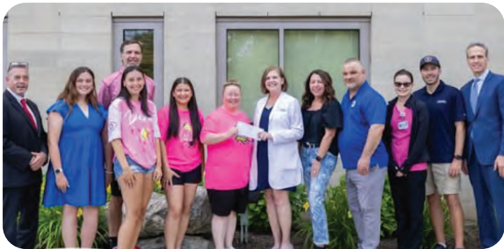
Ansonia and Derby high schools hosted Pink softball and baseball games to support breast cancer patients in the greater Valley community.