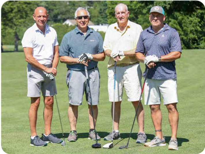
Griffin Golf Classic on June 30 at Brooklawn Country Club