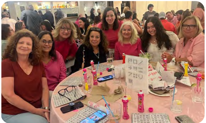
Pink Bingo on June 3 at Hops Company