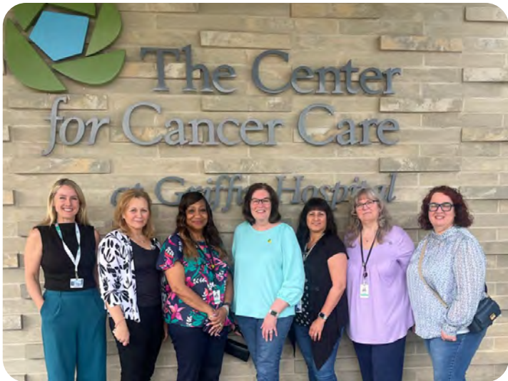
Thank you to the Legal Team at Subway in Shelton for donating handmade blankets and comfort items for patients at Griffin's Center for Cancer Care.